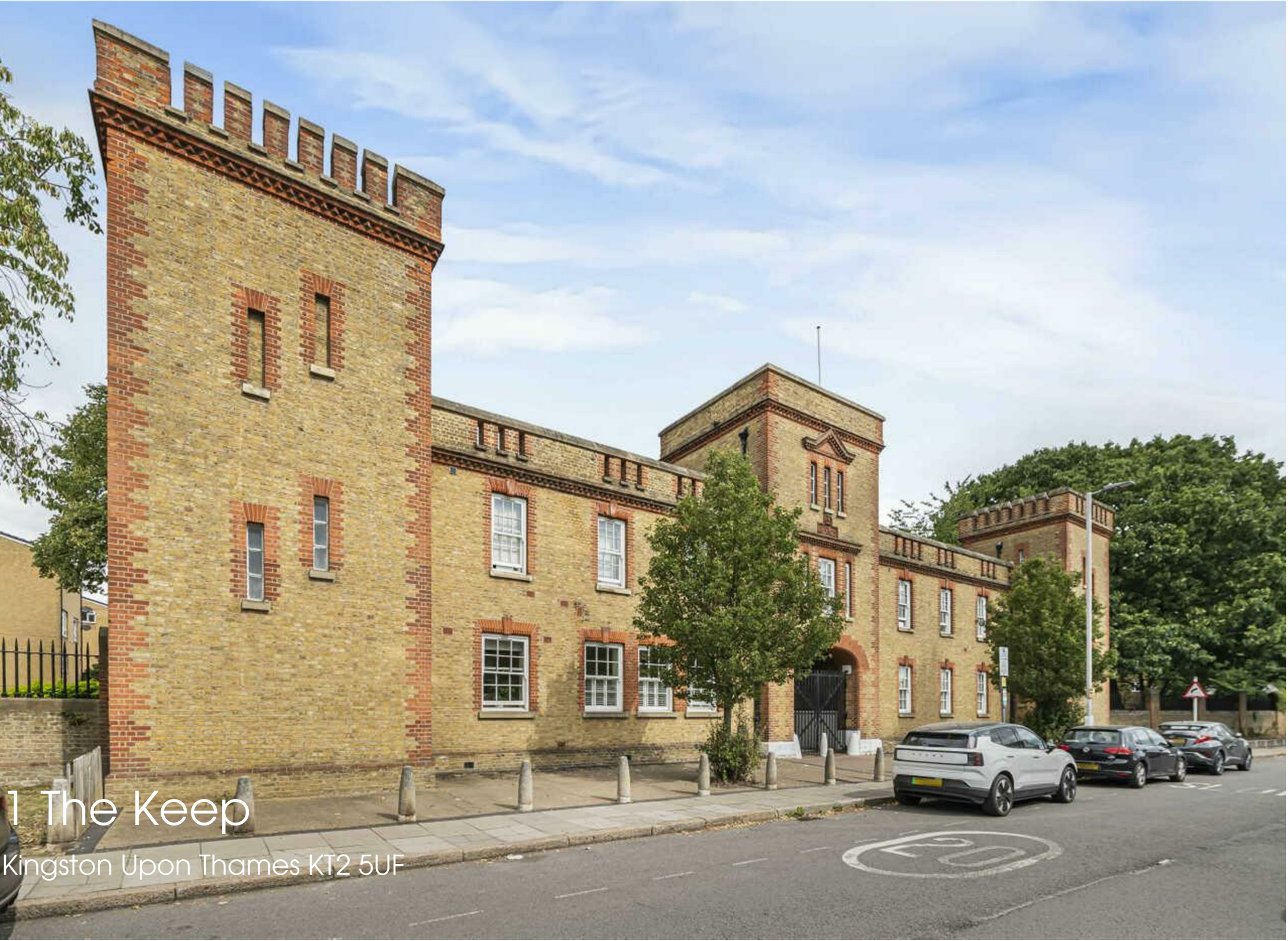
1 The Keep Kingston Upon Thames KT2 5UF